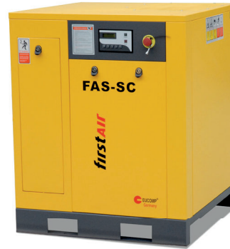
FAS SC 7-45