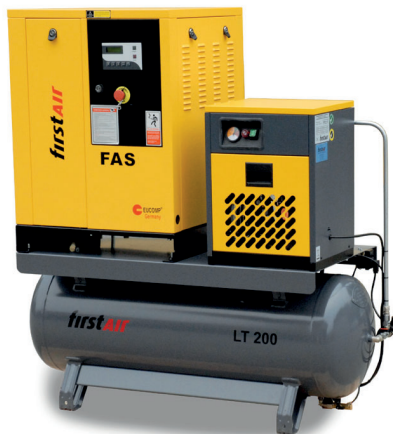
FAS AT 3-15