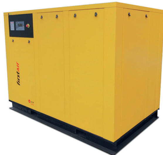
FAS (SC) 55-90

For the FAS series, compressor airends with above-average performance have been developed, designed and produced which, in combination with our high-quality thermostatic valves, suction regulators and separators, contribute to the reliability and longevity of the product. Our highly efficient compressor stages in combination with IE3 electric motors enable the screw compressors to achieve a high technological standard and high efficiency.